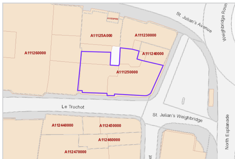
Mapping / Aerial Photography Copyright © States of Guernsey 2026