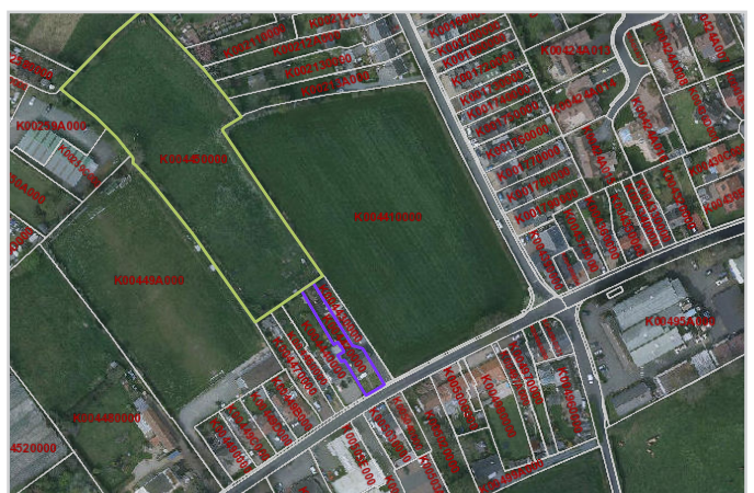
Mapping / Aerial Photography Copyright © States of Guernsey 2025