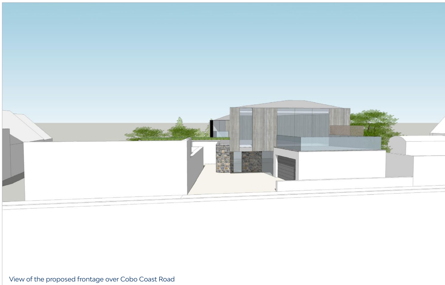
View of the proposed frontage over Cobo Coast Road