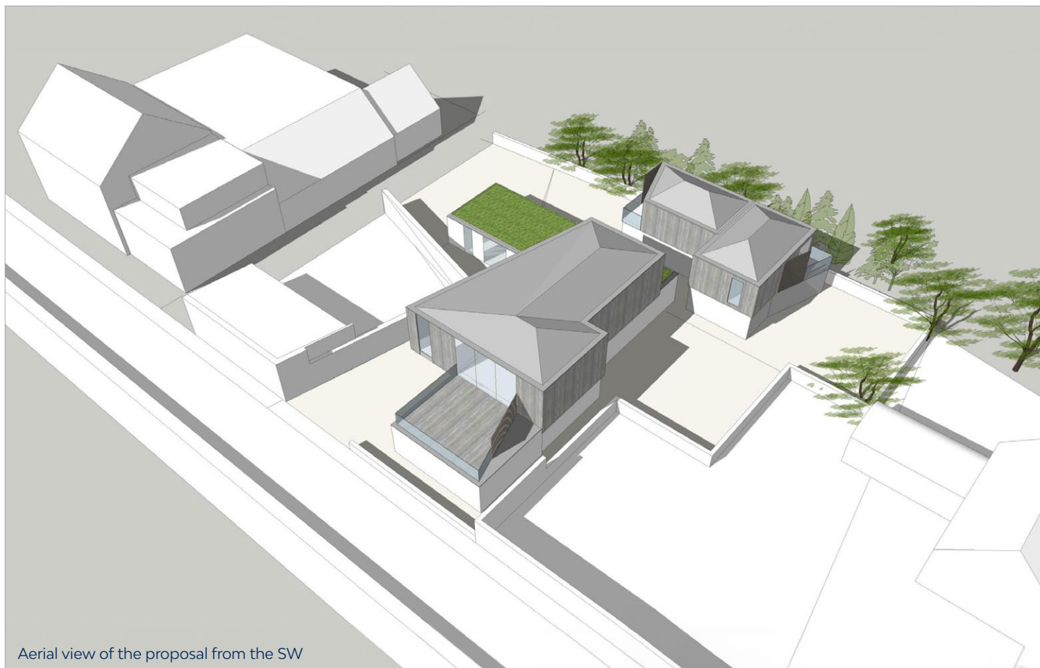
Aerial view of the proposal from the SW