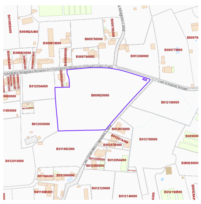
Mapping / Aerial Photography