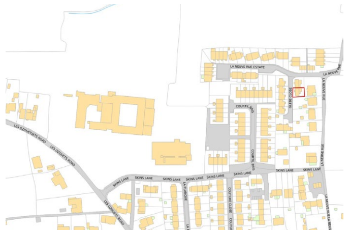
Mapping / Aerial Photography Copyright (C) States of Guernsey 2023

The property is approached off the clos road over a tarmac drive with parking for one car in front of the garage and a further space to the other side of the property, a path leads to the front door flanked to either side by a gravelled fore garden.