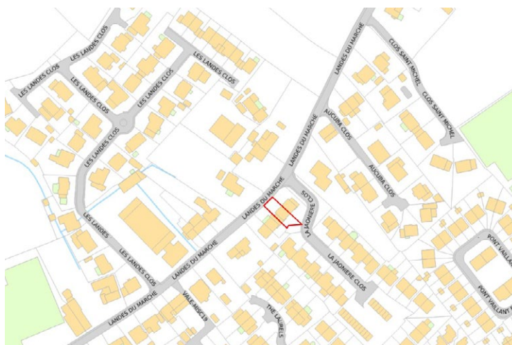
Mapping / Aerial Photography Copyright (C) States of Guernsey 2024