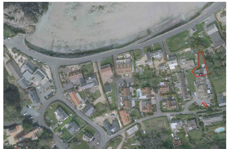
Mapping / Aerial Photography